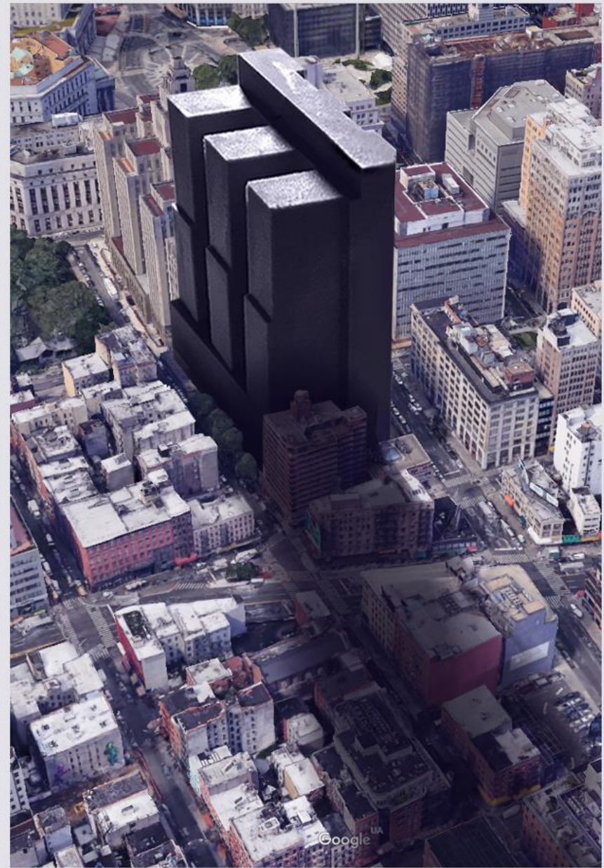
124-125 White St. Manhattan, before and after images showing the shadow cast by the 490 Ft. jail tower – Corresponds to shadow diagrams in CEQR No. 18DOC001Y Environmental Impact Study 2019