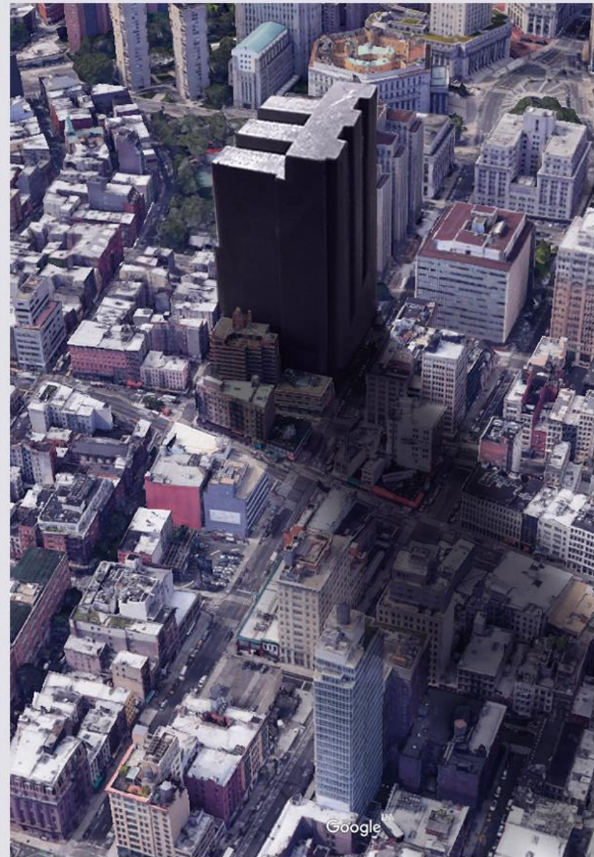
124-125 White St. Manhattan, before and after images showing the shadow cast by the 490 Ft. jail tower – Corresponds to shadow diagrams in CEQR No. 18DOC001Y Environmental Impact Study 2019